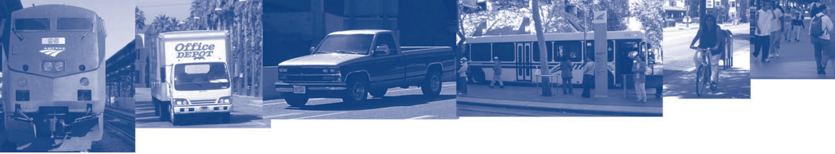
ILLUSTRATION OF FUNDING SOURCES - MINETA TRANSPORTATION INSTITUTE FISCAL YEAR 2002/2003