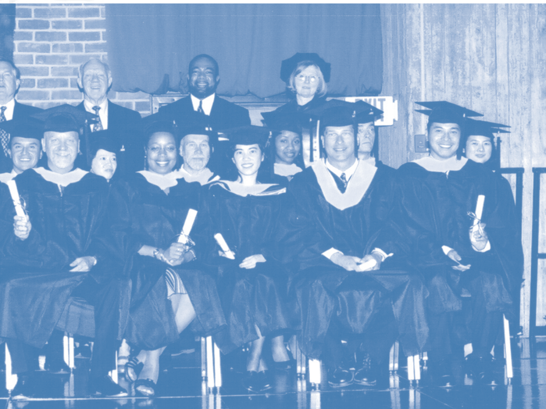
2004 MSTM Graduates