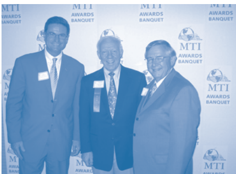
Congressman Oberstar with HNTB Executives