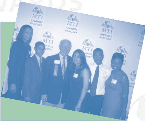
Congressman Oberstar with Argyle Middle School students and teacher.