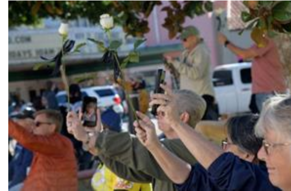
San Luis Obispo, CA