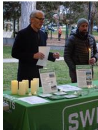
Salt Lake City, UT