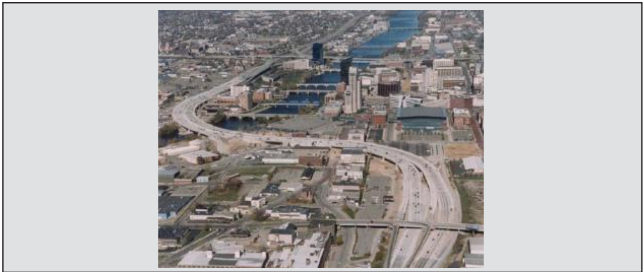
Figure 6. Grand Region, US 131 Grand Rapids S-Curve Replacement.