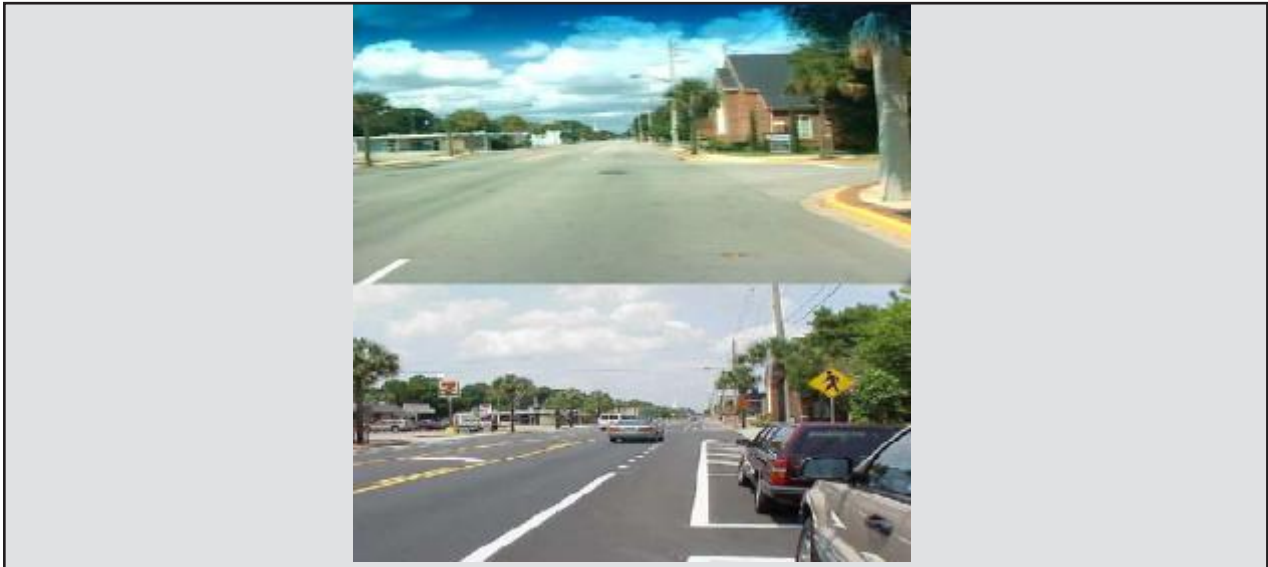
Figure 2. Edgewater Drive, Before and After Restriping.

Orlando is Florida's fifth largest city, population-wise, with more than two million residents living in the Greater Orlando metropolitan area (City of Orlando 2011). In addition, Orlando receives millions of visitors per year who travel to nearby parks, including Disney World and Sea World.