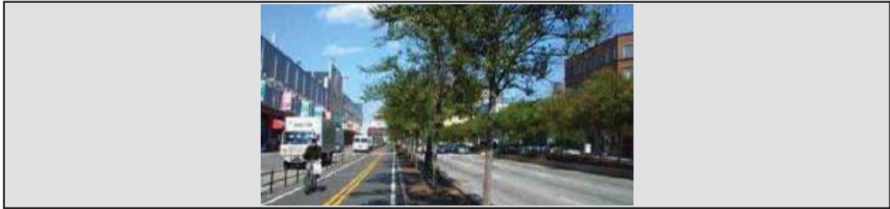
Figure 4. Joe DiMaggio Boulevard

With the closure and demolition of the elevated West Side Highway, the New York City DOT estimates that as many as 10,000 vehicles per day were diverted to Manhattan's other north-south routes, further taxing the capacity of these already congested roadways. The main goal of the Route 9A reconstruction project has been to address the problems associated with the continued use of the interim roadway and to accommodate some of the traffic diverted to other streets in the area when the elevated roadway closed.