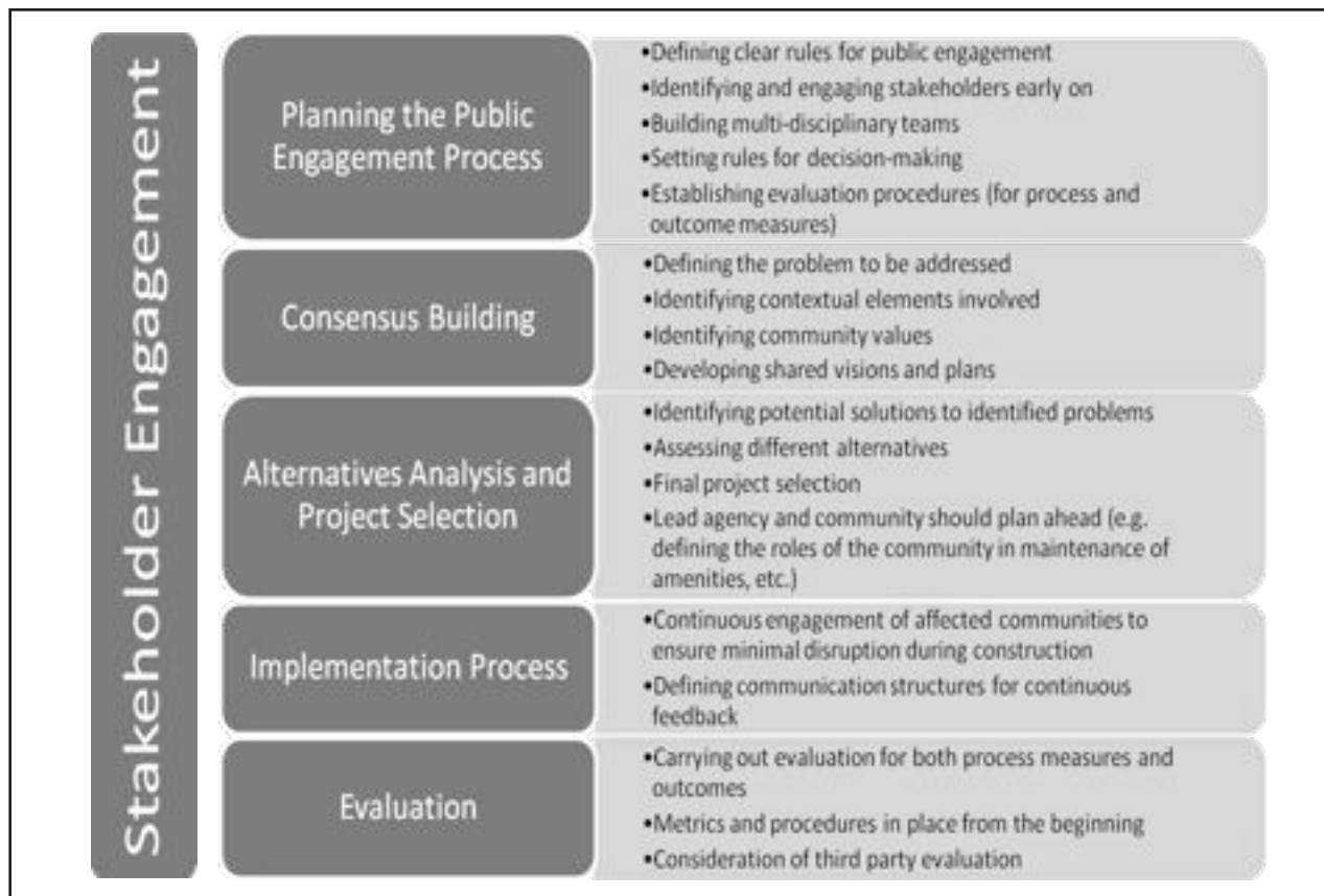
Figure 7. Flowchart of the Stakeholder Involvement Process.

Early involvement of stakeholders is seen to be of critical importance because decisions made during the early stages of project development can constrain the range of potential alternatives to be considered as well as “limit the flexibility available in the later design stages” (Nehuleni 1999).