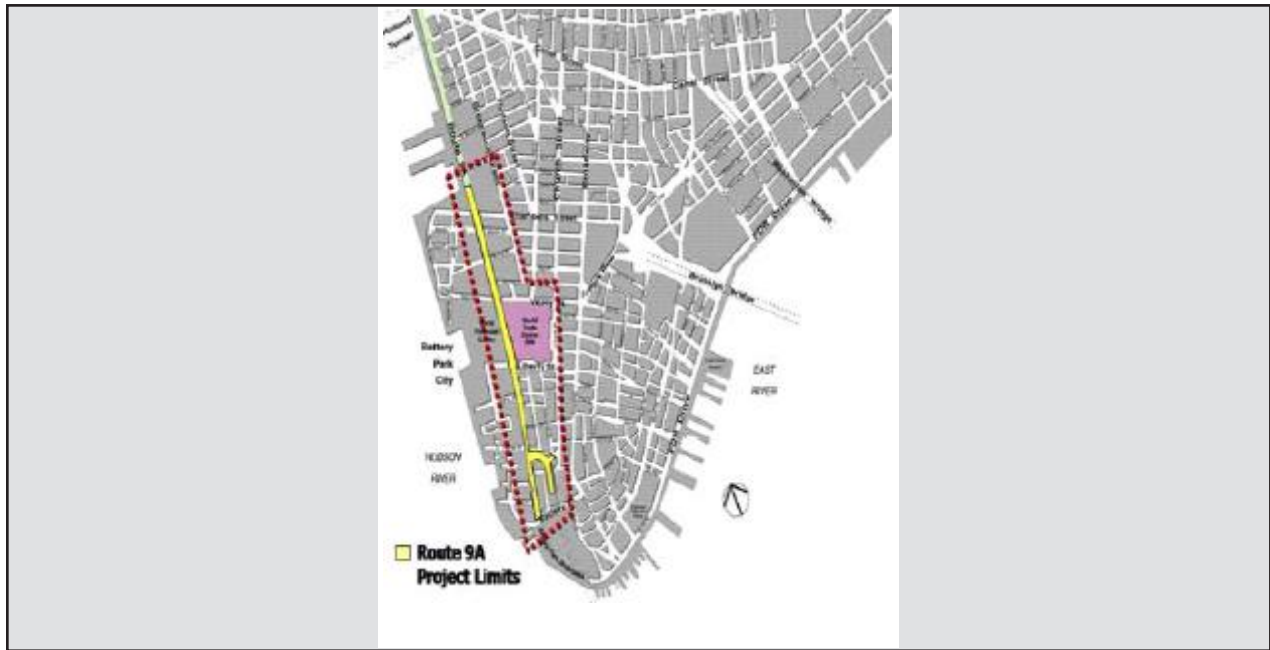
Figure 3. New York Route 9A

This reconstruction project spans a 5.7-mile section of Route 9A (also known as the West-side Highway), which extends along the Hudson River waterfront between Battery Place and 59th Street. The multimodal project includes a street-level six- to eight-lane north-south boulevard and a continuous bikeway and walkway, and it accommodates cars, trucks, buses, bicycles, pedestrians, and various recreational users. Average daily two-way traffic volumes range from 69,000 to 81,000 motor vehicles, demonstrating the importance of Route 9A to this metropolitan region (Eastern Roads, n.d.).