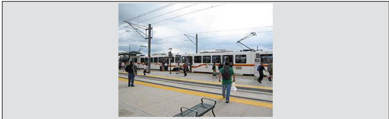
Figure 5. The T-REX Rail Line, Parallel to the Highway

The population growth rate of Denver's metropolitan region has consistently outpaced the national rate every decade since the 1930s. The region grew steadily in the past 10 years, averaging 1.9 percent population growth each year from 1999 to 2009. The current population exceeds 2.8 million people, and by 2030, it is anticipated to increase to almost 3.8 million (MetroDenver, n.d.). The T-REX project, which includes the "Southeast Corridor" in the Denver Metro area, connects the bustling downtown Denver Central Business District and the Southeast business district. These two major employment centers concentrate more than 180,000 people on a daily basis, plus approximately 30,000 additional workers employed along this corridor, which is expected to continue to grow over the next 20 years (RTD, 2007).