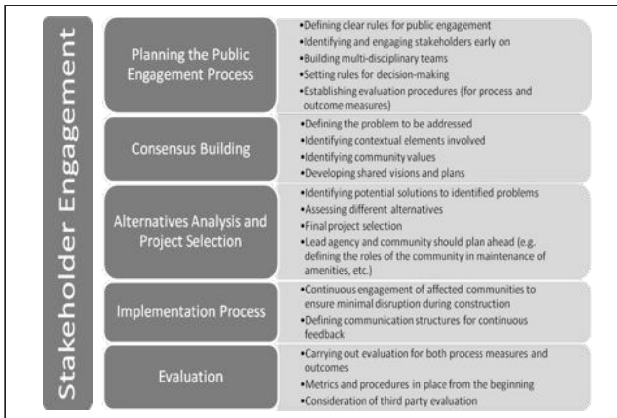
Figure 7. Flowchart of the Stakeholder Involvement Process.

Early involvement of stakeholders is seen to be of critical importance because decisions made during the early stages of project development can constrain the range of potential alternatives to be considered as well as “limit the flexibility available in the later design stages” (Nehuleni 1999).