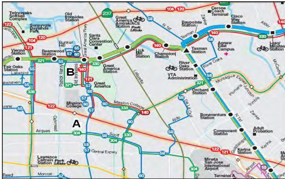
Figure 1. Geographic Location of Sampled Companies