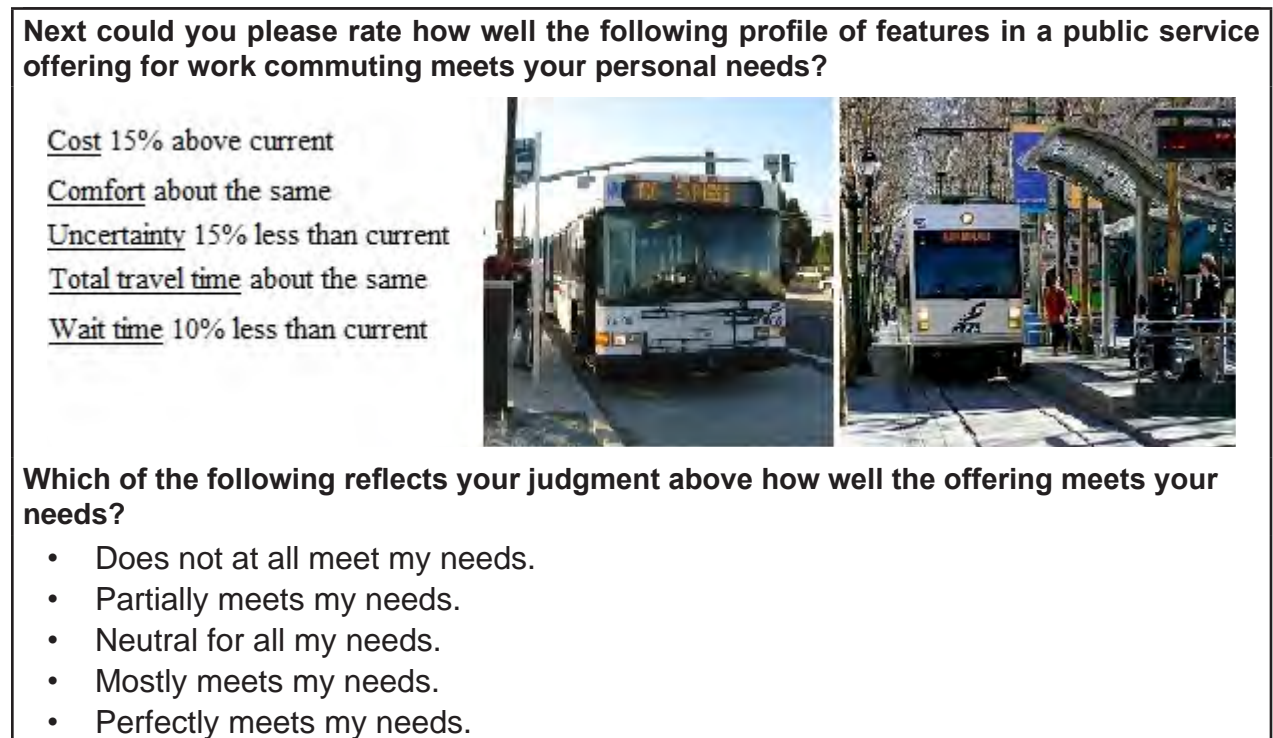
Figure 2. Exemplary Screen in Full Profile Choice Task

Figure 2 shows an exemplary screen from the ACBC task that was used.