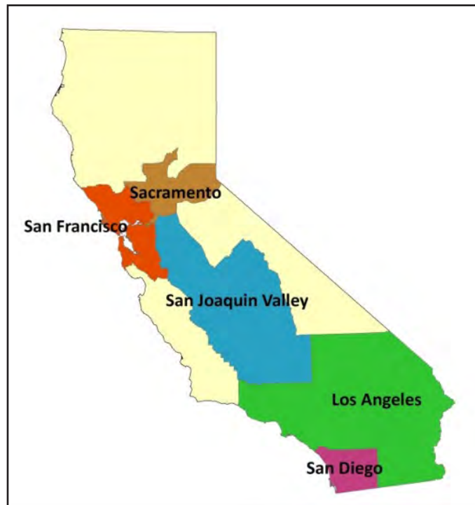
Figure 2. Map of California and Five Major Regions