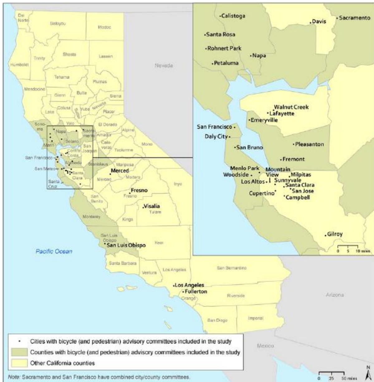
Figure 1. Map of the 42 Committees Included in the Study

In addition, efforts to recruit women were reviewed, and the committee bylaws and other official documents were examined for language about gender and/or the need for diversity.