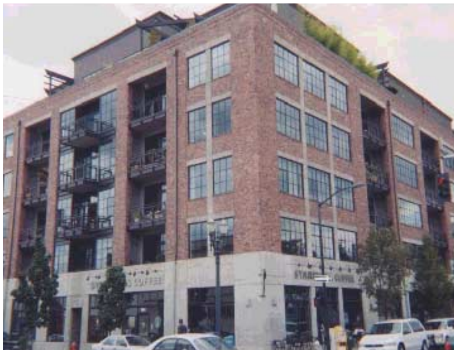
Figure 2-8: The McKenzie Lofts, Portland Source: Ankrom Moisan Associated Architects

Developed by Carroll Investments and designed by Ankrom Moisan Associated Architects, the property occupies 134,000 square feet and contains nine ground-floor spaces that offer 13,500 square feet of retail space, 68 housing units (the lofts) on five upper stories, and an underground, electronically accessed garage. The Lofts contain either one or two bedrooms and range from 682 to 1,725 square feet. 179 The development is adjacent to bus lines and is near Portland's downtown financial district. Ninety per cent of the units in the project were sold prior to its completion in the fall of 1997. 180 The total cost of the project was $14.5 million. Financing for the Lofts was conventional and Fannie Mae approved, so no public subsidies were used. The McKenzie Lofts project serves households with medium to upper incomes, as described in the "strategy" plan.