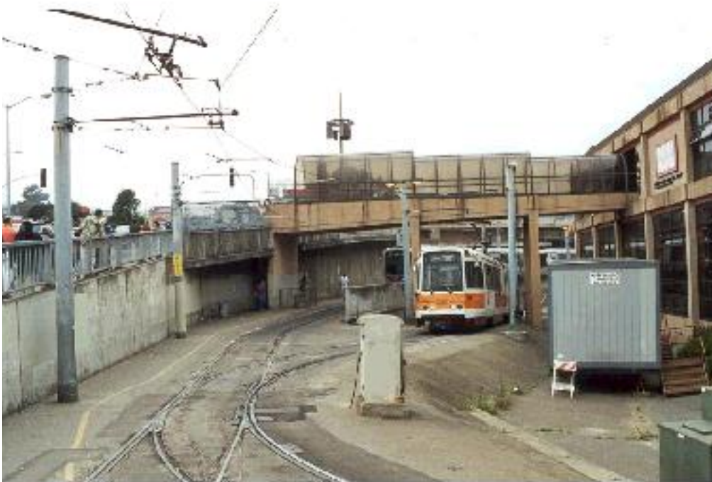
Figure 2-5: Balboa Park Station on Geneva Avenue Photo Courtesy of the San Francisco Planning Department, August 2000

The Outer Mission, Ocean View, West of Twin Peaks, Crocker-Amazon, and Excelsior neighborhoods surround the station. Other neighborhoods in the transit corridor are Glen Park, Bernal Heights, Noe Valley, and the Mission. The work program for the Balboa Park Station plan is based on the involvement of all those neighborhoods in the planning process. The success of the final plan implementation will depend on the communities' direct participation in the planning process and ownership of the transit-oriented urban community plan. The exact area to be studied and planned has been determined by "comfortable walking distances to the station, existing land uses, (and) major destinations" in the vicinity of the station. 104