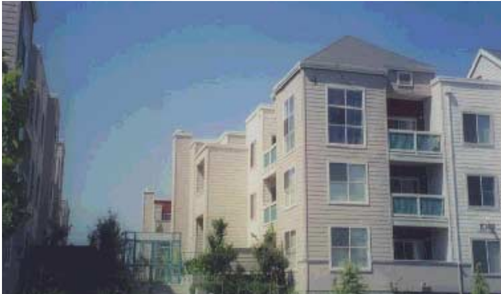
Figure 2-1: Almaden Lake Village