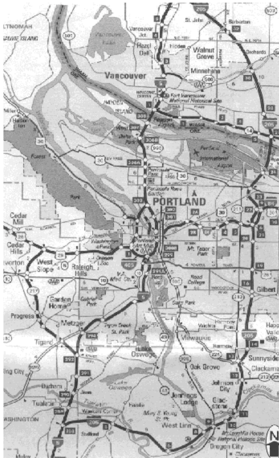
Figure 2-9: Portland Regional Map