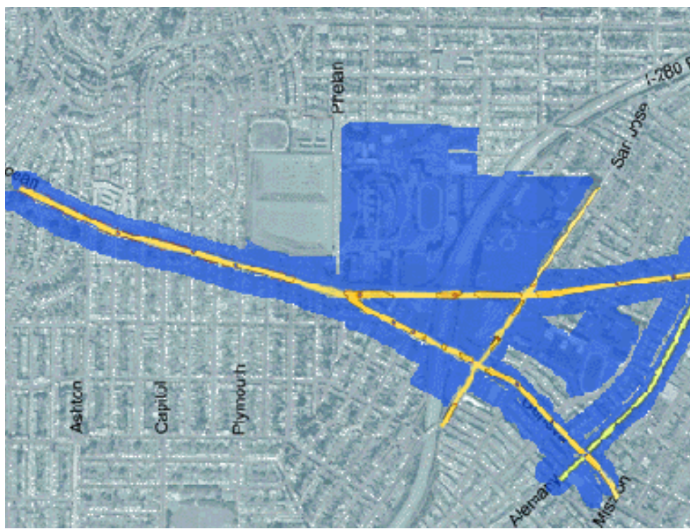
Figure 2-7: Balboa Park Station Study Area.

Photo Courtesy of the San Francisco Planning Department, August 2000