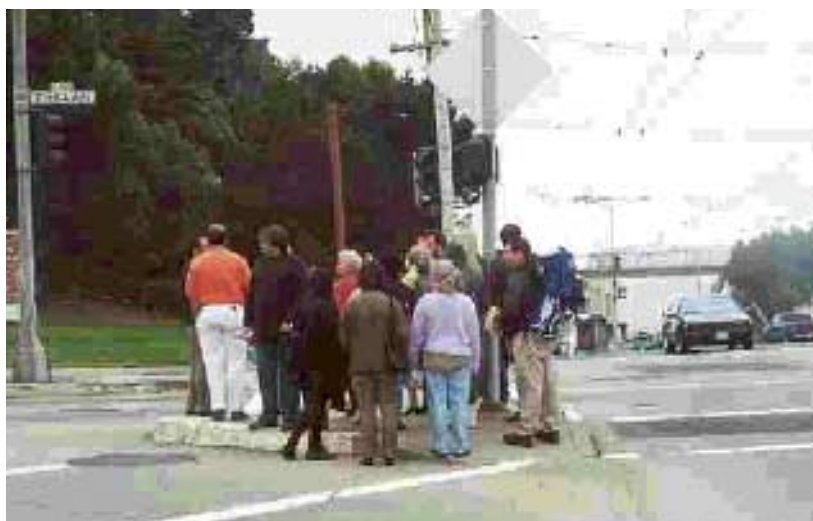
Figure 2-6: Neighborhood Walking Tour

Better Neighborhoods 2002 is a program created by the planning department to address changes happening within the city and to create better urban neighborhoods through the planning process. The plans will largely address housing and transportation challenges by establishing a strong relationship between land use and the transit system. The planning department also recognizes that “a great neighborhood also needs a full range of city services, safe and lively streets, gathering places, and an appreciation for its special character.” 105 Balboa Park is one of the first neighborhoods to be improved. The most recent step of the Better Neighborhoods 2002 program was a neighborhood workshop, a walking tour of Balboa Park Station area, and a bus tour of surrounding neighborhoods. Neighbors participating in the planning process were given workbooks as a tool for participation and for keeping abreast of the planning process for the station. Another workshop was held in late August.