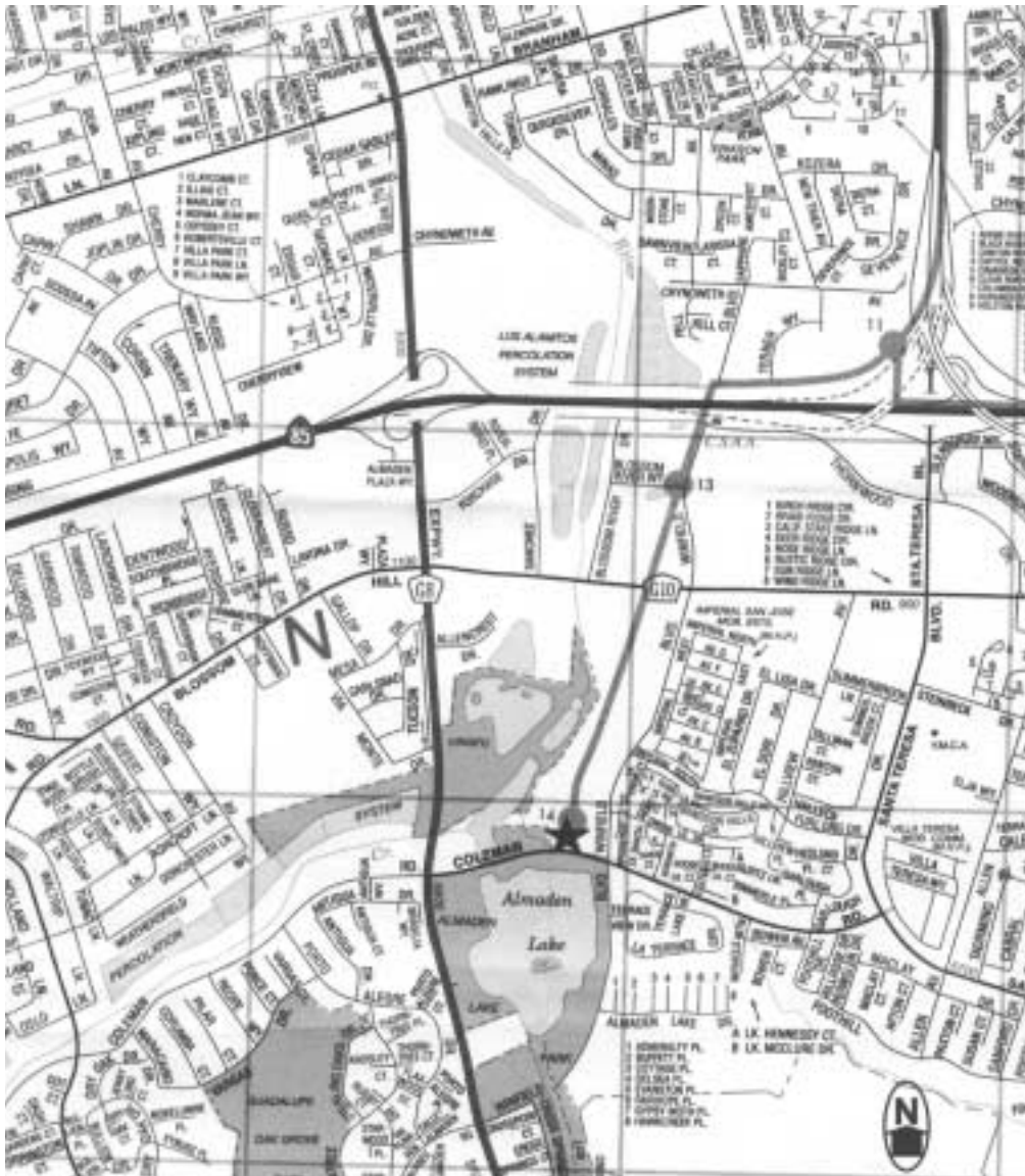
Figure 2-2: Almaden Lake Village Neighborhood Map