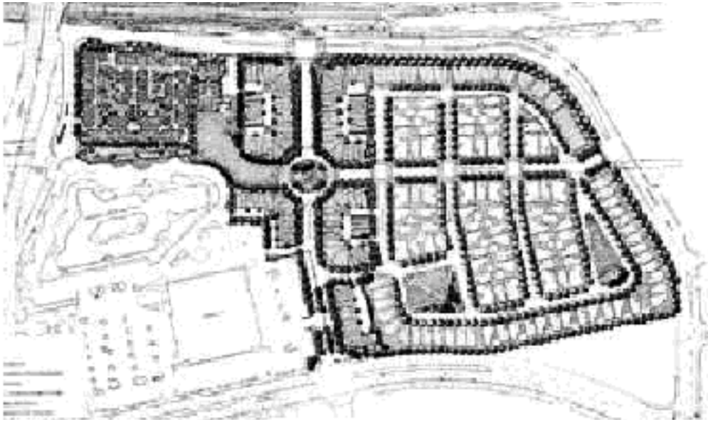
Figure 2-4. The Crossings

The development was enabled by the San Antonio Station Precise Plan, which divided the area into five sub-areas. The Crossings was developed in “Area D,” an area bounded by California Street, Central Expressway, Showers Drive, Pachetti Way, and the Old Mill Office Building Site. The city conceived “Area D” as an opportunity to combine housing, transit, and proximity to shopping services, making it ideal for higher-density residential development.