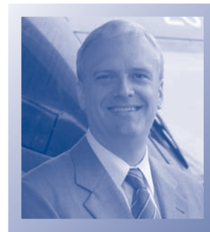
President and CEO Amtrak and MTI Board of Trustees