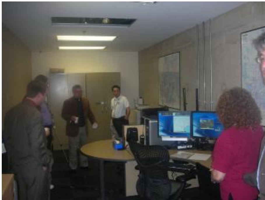
Figure 13 Dallas EOC Radio Room