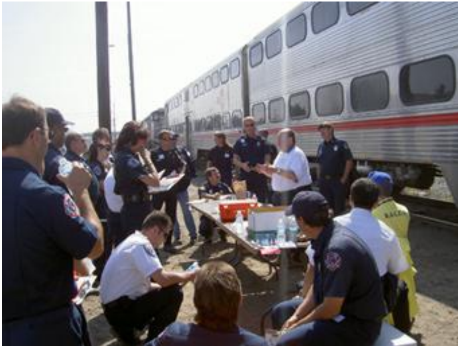
Figure 3 Train Disaster Exercise for San José Fire Department