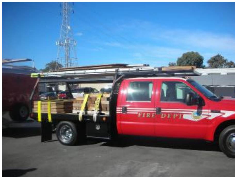
Figure 11 Santa Clara County Fire Department's Technical Assets Truck