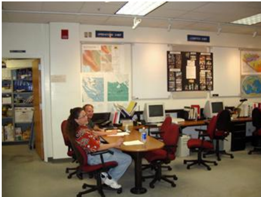
Figure 14 City of San José EOC Ops Section