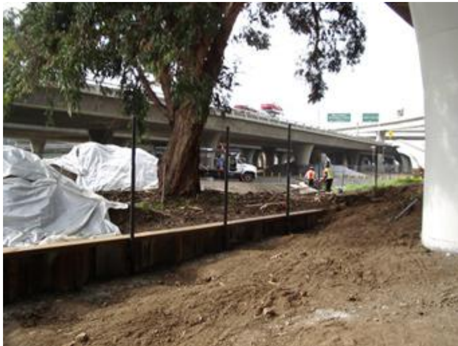
Figure 10 Emergency Preparedness: Building Trusses to Prevent Mudslides in Downtown San José