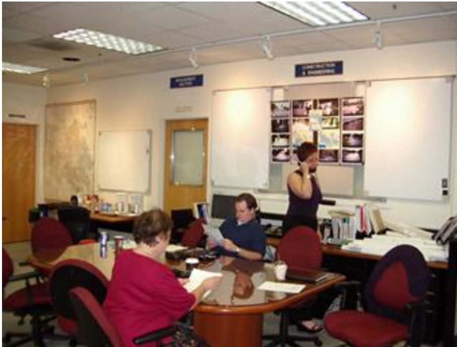
Figure 8 City of San José EOC Construction and Engineering Branch