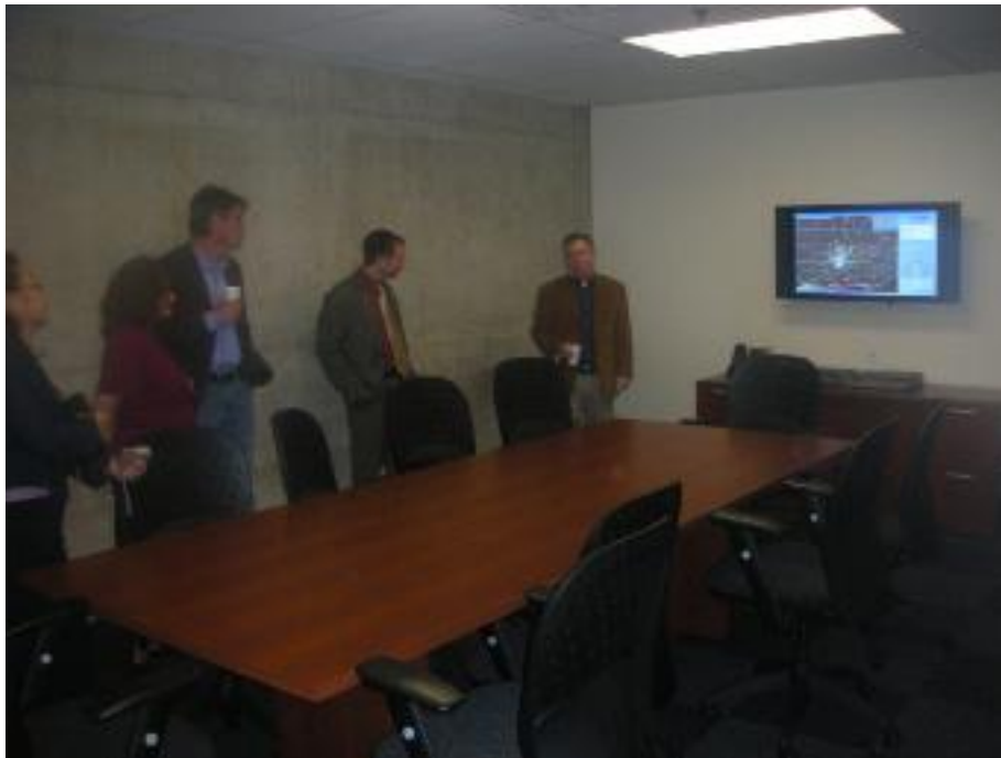
Figure 12 Dallas EOC