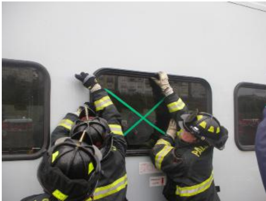
Figure 4 Removing a Window as Part of San José Fire Department Disaster Exercise