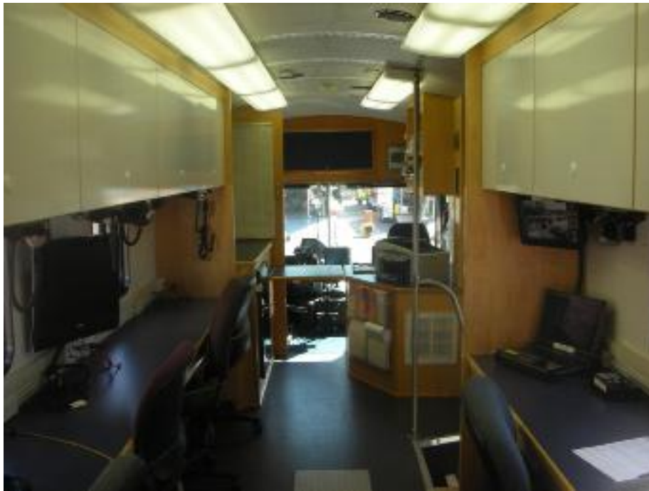
Figure 16 Interior View City of San José Fire Department's Mobile Emergency Operations Command Van