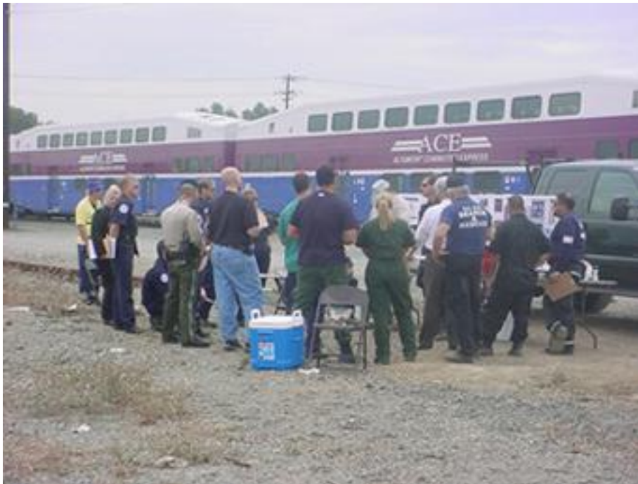
Figure 1 An Example of a Disaster Preparedness Exercise in San José

In either scenario the existence of COOP and COG plans would guide whatever staff remained capable to undertake priority work first, and maintain essential functions to support state and federal response.