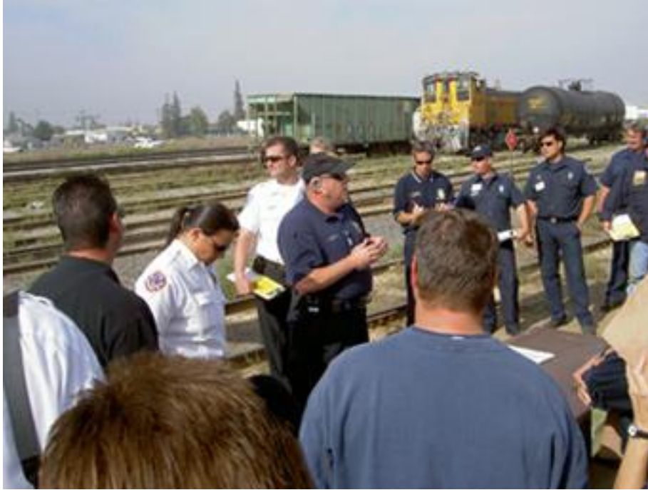
Figure 2 Train Disaster Exercise in San José