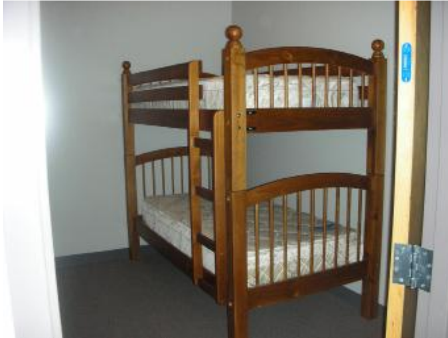
Figure 6 St. Tammany Parish, Louisiana, EOC Sleeping Area

emergency operations plan staff. Ideally it should have telephones and computers already installed, or easily accessible jacks where they can be installed at set-up. Dormitory and feeding space, break areas and adequate restrooms are also essential elements of the emergency operations center space. 59