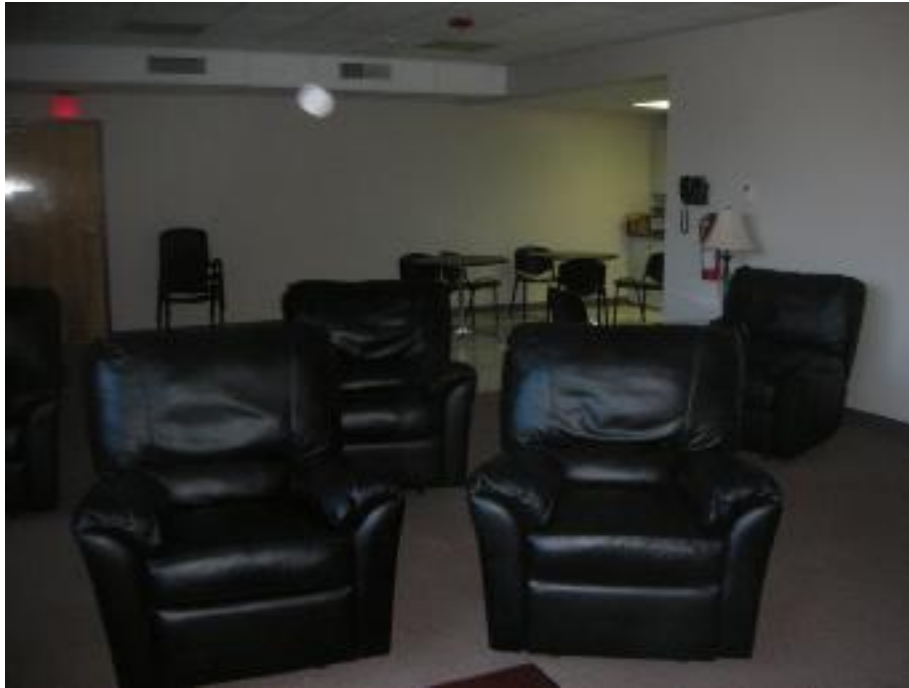
Figure 7 St. Tammany Parish, Louisiana, EOC Living Quarters

Transportation department emergency operations centers are likely to be focused on engineering activities. As such technical equipment such as GIS software, large plotters and drafting tables may be needed. As in all EOCs, adequate copies of the plan, supporting documents and reference materials, and lists of existing contracts and approved contractors, are needed. Each person designated as a EOC Section Chief should assist in the development and supplying of the EOC to ensure that tools and equipment needed by his section to accomplish their tasks are available at all times, either by being stored in the EOC or being on the response checklist of all EOC staff members for that section. Up to date maps and “as-builts” drawings, for example, might be in use in day-to-day offices, but need to be brought to the EOC during emergencies. It is the emergency manager’s responsibility to educate the section chiefs on their roles so that they may determine the essential response support items.