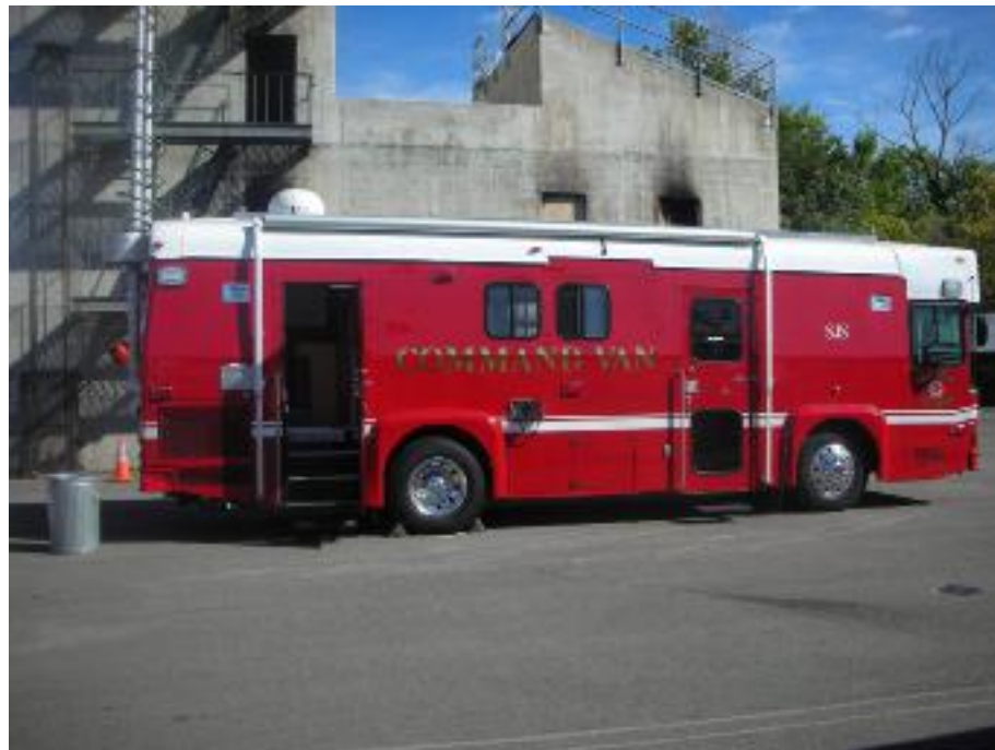
Figure 15 San José Fire Department Mobile Emergency Operations Command Van