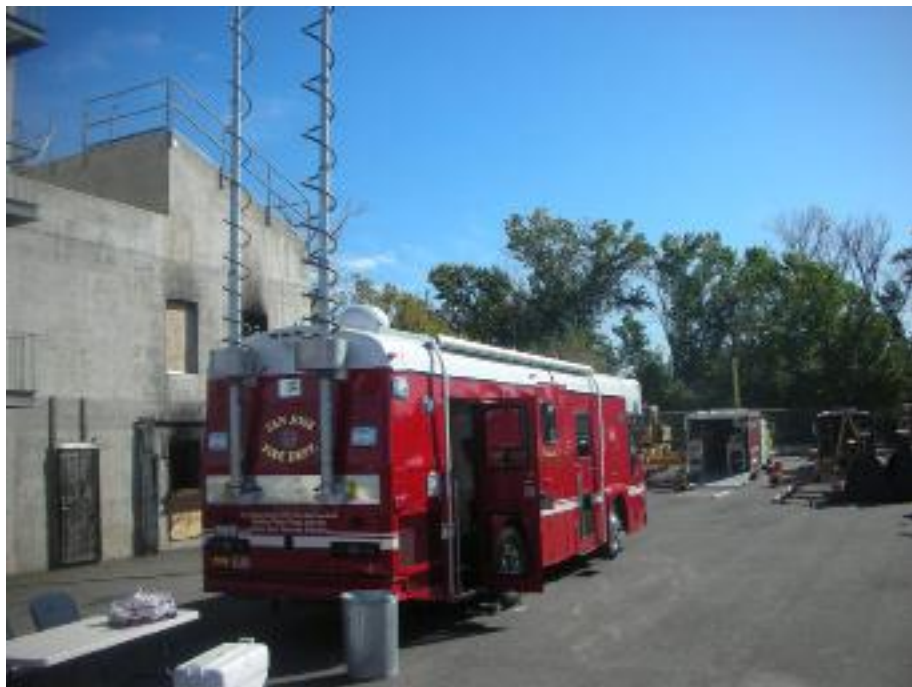
Figure 17 Additional View San José Fire Mobile Command Van