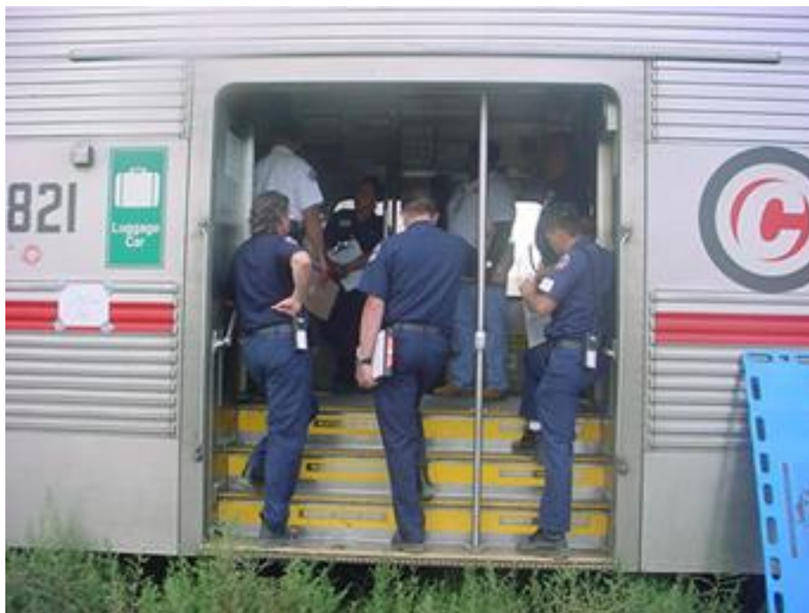
Figure 5 Preparing for a Victim Rescue During Train Exercise in San José