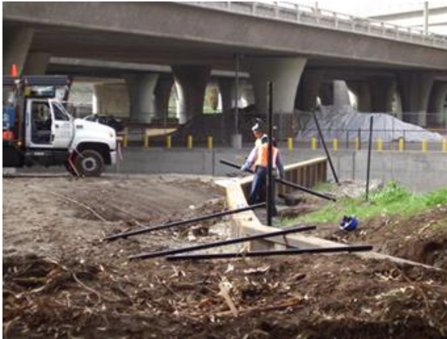
Figure 9 Emergency Preparedness: Preparing a Section of Highway in San José for Mudslide Containment

Each state is also eligible for pre-disaster hazard mitigation funds from a variety of federal sources. Tables contained in the SHMP outline federal mitigation funding available from FEMA, Environmental Protection Agency, National Oceanic and Atmospheric Administration, Army Corps of Engineers, Fish and Wildlife Service, Housing and Urban Development, Bureau of Land Management, Department of Agriculture, disaster relief from a variety of agencies, and research support. 70 A SHMP should also include a description of the transportation agency's role in the state's overall disaster mitigation efforts. 71 The transportation agency emergency manager would be a partner with the emergency management agency in the every three-year revisions of the SHMP, as well as contributing to mitigation coordination activities with other state agencies.