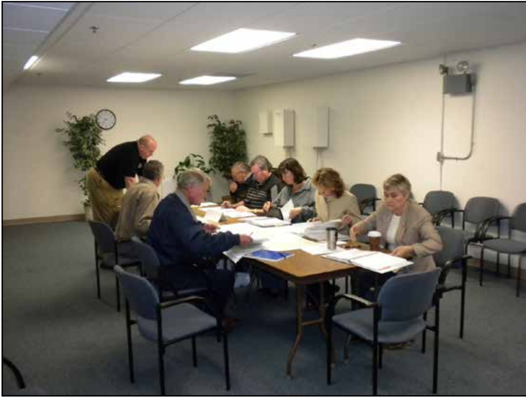
Figure 7. Tabletop Exercise