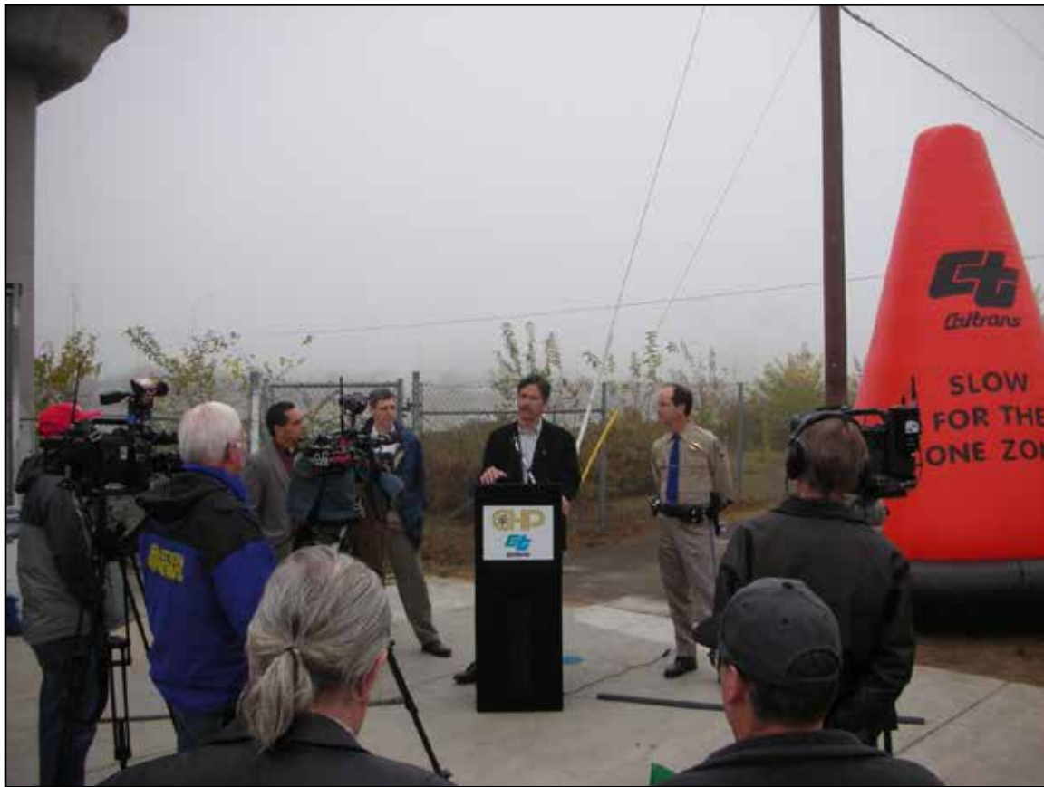
Figure 5. Press Conference at Full Scale Exercise