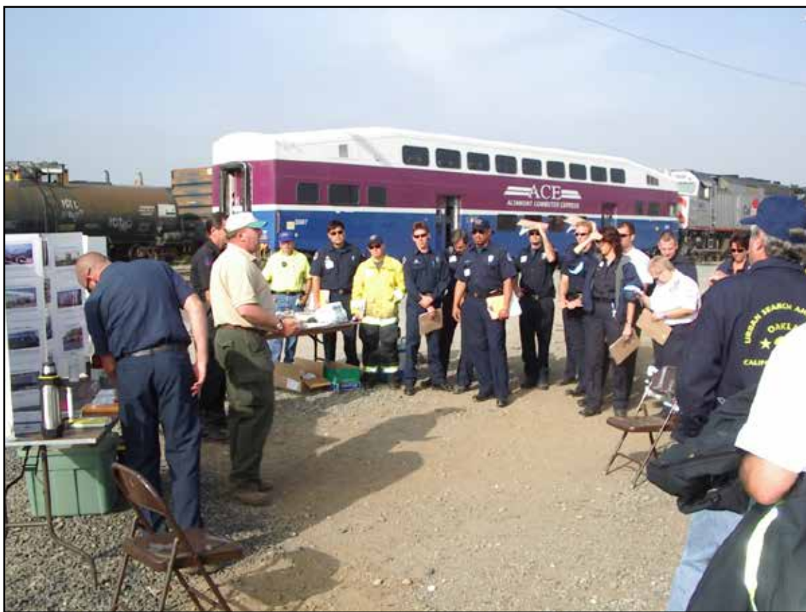
Figure 2. Learning Station at Facilitated Exercise, ACE

In 2002, Mineta Transportation Institute researchers began delivering emergency management training to the California Department of Transportation (Caltrans) headquarters and district staff members. Over 25 deliveries of transportation-customized class offerings, including 2.5-hour-long Incident Command System/ Standardized Emergency Management System/National Incident Management System (ICS/SEMS/NIMS) and 8-hour-long SEMS Emergency Operations Center, and Continuity of Operations courses, have resulted in knowledge about the methods used and the challenges faced in delivering emergency management training and exercises by the nation's largest transportation agency for its staff members. The MTI researchers have also worked with Valley Transit Agency (VTA) in Santa Clara County, Altamont Corridor Express Rail (ACE) (see Figure 2), Caltrain, and Amtrak on full scale exercises over the past 15 years. As a result of this exposure to the transit and transportation community, they became aware that training and exercise resources specifically developed for transportation and transit agencies are scarce.