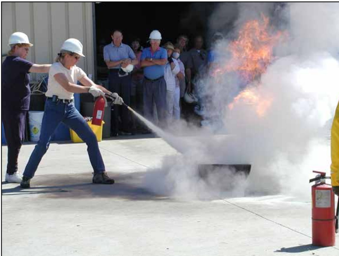
Figure 1. Fire Extinguisher Use Drill

When transportation agency personnel were interviewed for Emergency Management Training and Exercises for Transportation Agency Operations (MTI Report 09-17 [Edwards & Goodrich 2010]) in 2009-2010, they stated that they had little help in developing a thorough and effective training and exercise program specifically for transportation personnel, and often relied on multi-agency training and exercise events focused on police and fire personnel for achieving their exercise goals (see example in Figure 1). This handbook provides guidance materials, templates and scenarios specific to transit and transportation exercises.