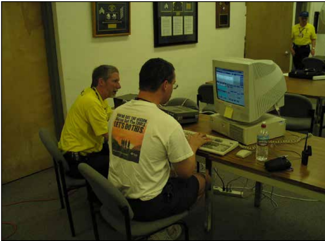
Figure 8. Simulators at Functional Exercise