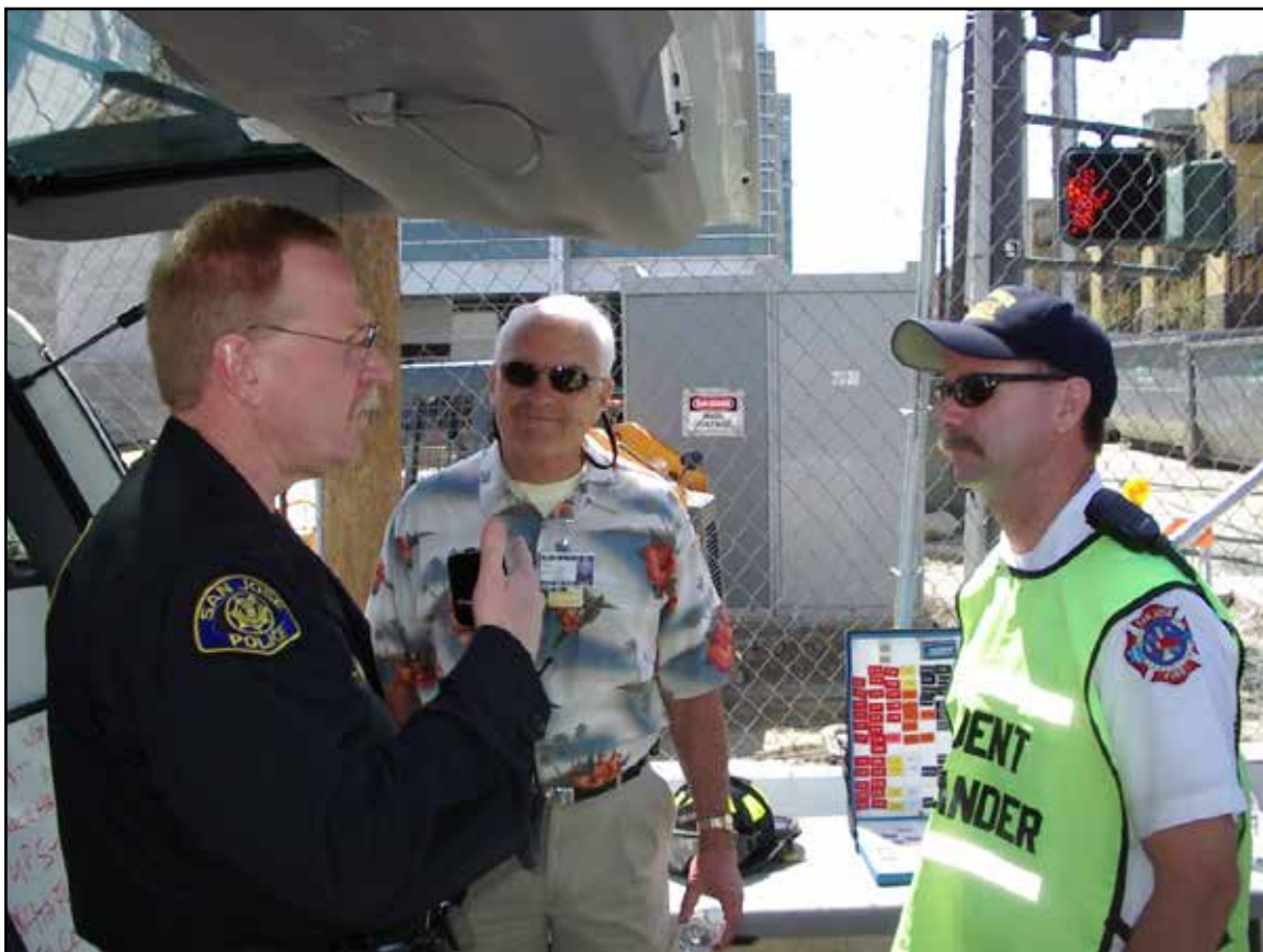
Figure 3. Evaluator Observes Command Post Interaction at Full Scale Exercise

In 2005 and 2009, Edwards and Goodrich served as exercise committee members and exercise evaluators for full scale exercises on the local railroad (scene shown in Figure 3). They were able to test a theory that, while full scale exercises often leave people confused about the right behavior in a disaster, the facilitated exercise was more successful with adult students who benefit from experiential learning and guided discussions. However, few transit and transportation personnel had the background in emergency management to develop meaningful scenarios on which to base the exercises, thereby limiting the value of the exercise. It seemed clear from Edwards' and Goodrich's practical research that a handbook was needed that would guide transportation and transit personnel in developing effective exercises for their agencies.