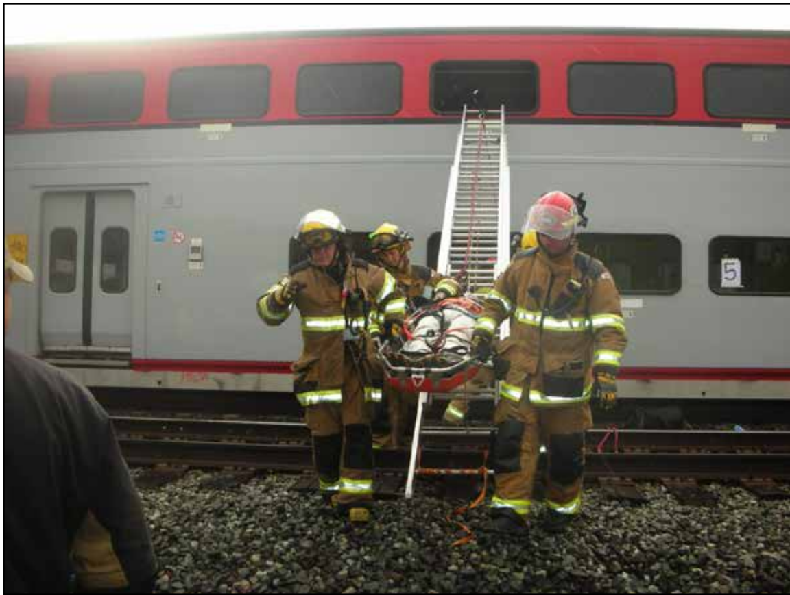
Figure 4. Rescue from Train at Full Scale Exercise