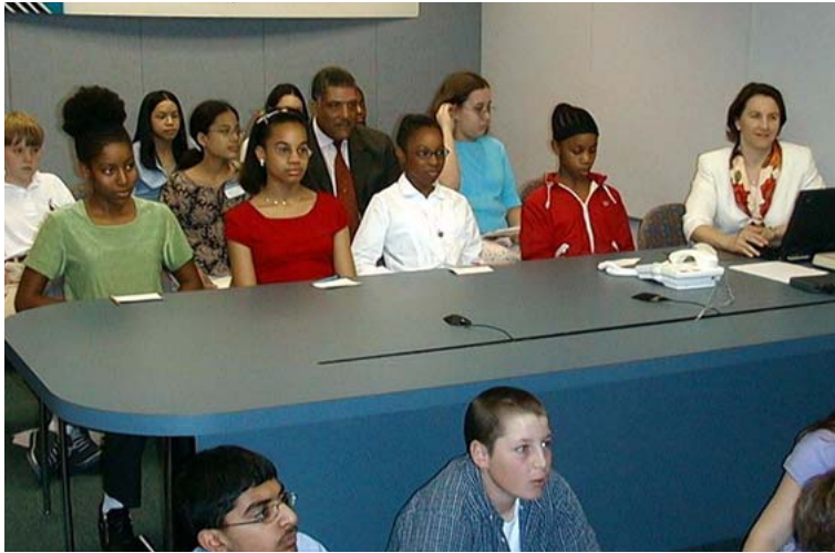
Figure 3: Jones Middle School Students in Hampton Roads, VA.