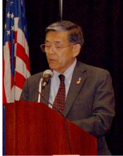
Fig 2: Norman Y. Mineta, Secretary of Transportation

“Think about how difficult it would have been for you to get to school or back home or to your favorite shopping mall, if we didn’t have safe and reliable forms of transportation,” asked the Secretary.