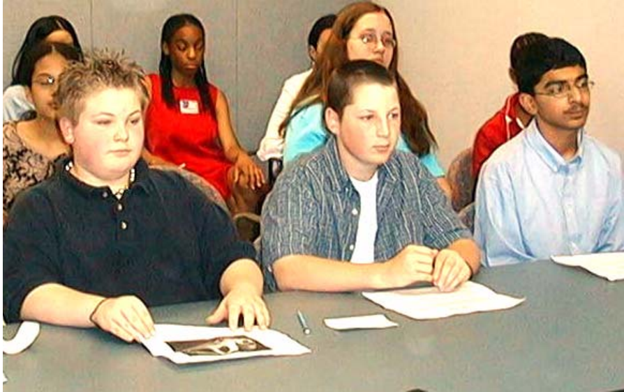
Figure 1: Students at Jones Middle School in Hampton Roads, VA. listen to a presenter via videoconference technology